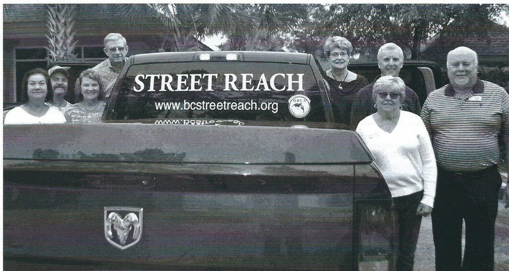
ORCA donated its $10,000 national MADD award to Streetreach to purchase a truck to transport the homeless.