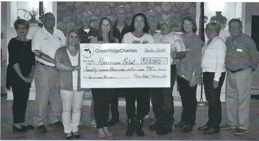
ORCA donated nearly $90,000 to hurricane relief.