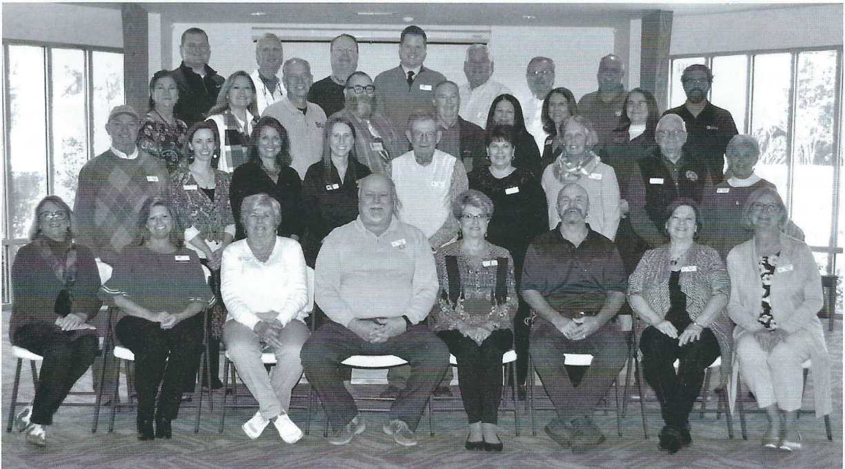
ORCA directors and charity leaders gathered to celebrate ORCA'S record breaking 2018 fundraising for local non-profits.