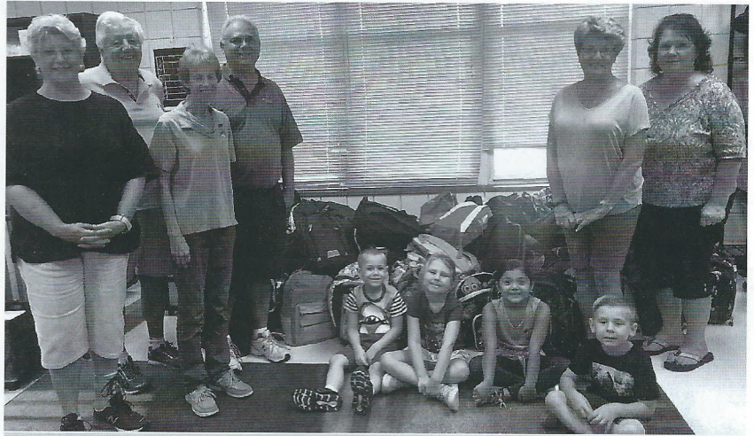
Nearly 300 backpacks of weekend food for undernourished schoolchildren were collected in Ocean Ridge and donated to several local schools.

“Your generosity ensures that patients and families receive the care and support they need when it matters most.” Lower Cape Fear Hospice