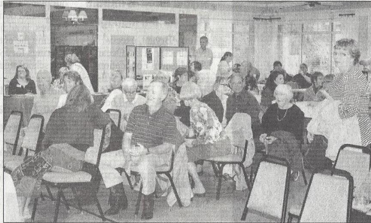
RIGHT: Some of the residents who attended

Ocean Ridge Charities Association Inc. (ORCA) hosted a wine and cheese party Oct. 27 at Ocean Ridge Plantation Club for Ocean Ridge residents to celebrate its fifth anniversary. This gave ORCA and its top charities, which were also represented, an opportunity to thank residents for their contributions of time and money since ORCA began.